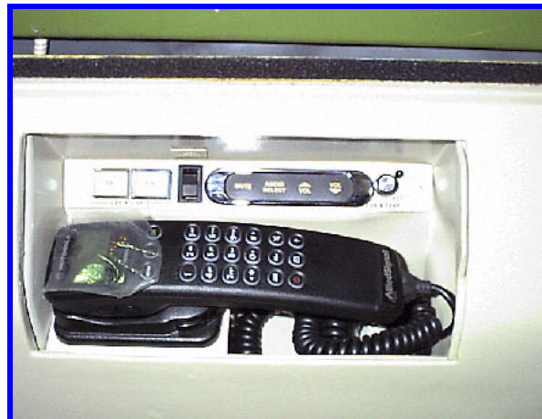
Flight Telephone Installations on Corporate Aircraft