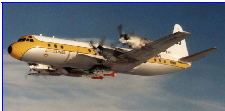
External Stores Testing on Lockheed Electra Aircraft

Staff experience also includes the planning of flight test programs, the setup and installation of flight test instrumentation and data acquisition equipment, and the analysis of flight test data.